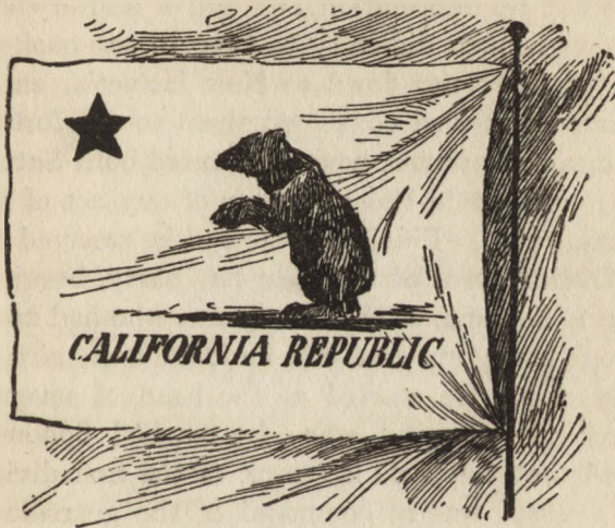
CALIFORNIA BEAR FLAG

pressed into service a strip from the red-flannel shirt of another of that gallant band and sewed the red to the white. Then he found a pot of paint and in the northwest corner of the "flag" he painted a star, and not far away the counterfeit presentment of a bear (the Californians thought it was a pig) and the proud words "California Republic." The Mexican flag was hauled down and this