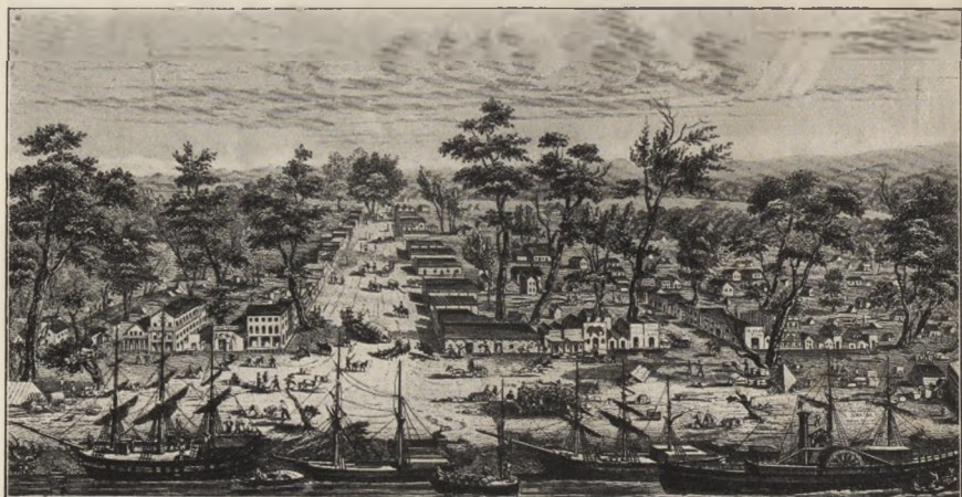
SACRAMENTO, CALIFORNIA. 1850